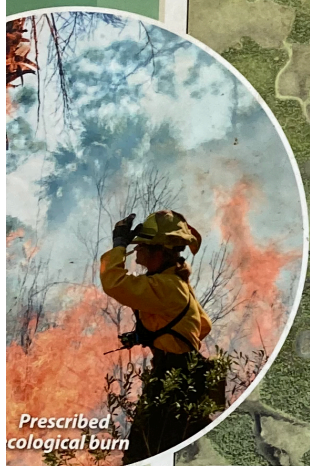
Prescribed ecological burn

t runs creek you nect State While of will g oak ds. ong ers y be ed